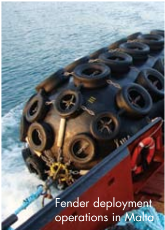
Fender deployment operations in Malta