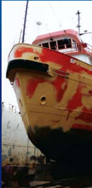
SPT Guardian getting a face lift during drydock operations