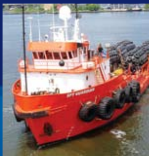
SPT Guardian ready for service in West Africa