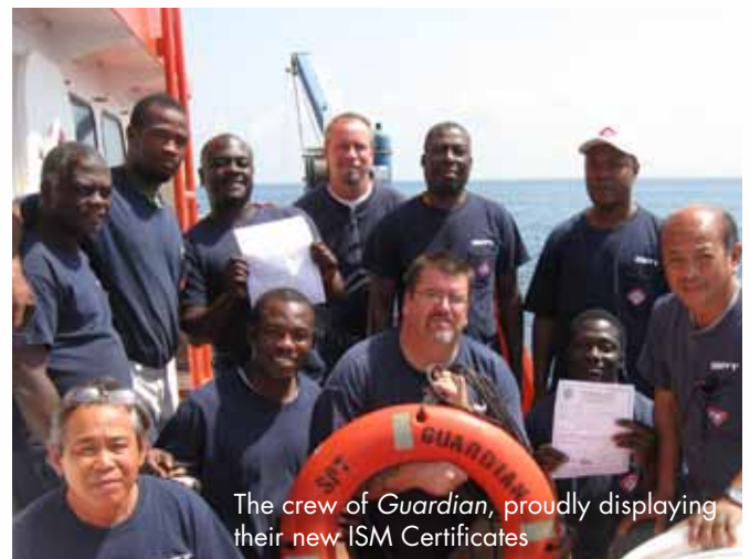
The crew of Guardian , proudly displaying their new ISM Certificates

This commitment also represents a significant opportunity to strengthen the utilization for our core tanker fleet and provides SPT a favorable rate in exchange for a premium service. Our reputation as a world class provider with excellent safety and operational records has been validated with this contract award. Congratulations to a job well done by the commercial team!