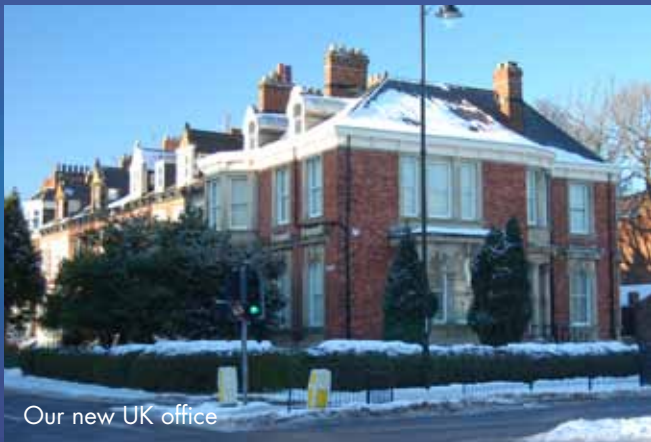
Our new UK office